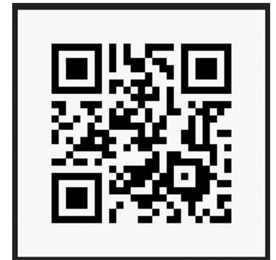
USFQ Quito and San Cristóbal Wi-Fi Access