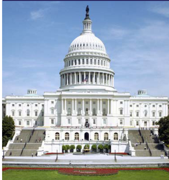
Washington, DC 7–9 November 2025