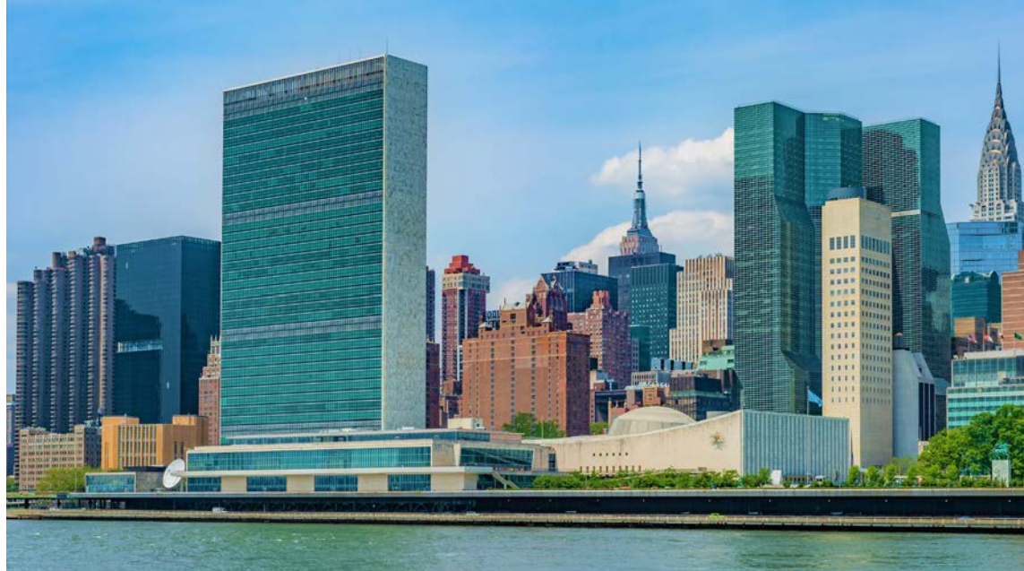
New York 6–10 or 13–17 April 2025

Register and Wake Up in a City That Never Sleeps!