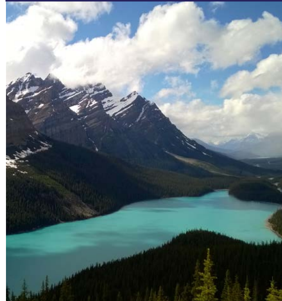
Banff, Canada 23–29 November 2025