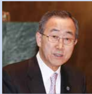
H.E. Ban Ki-moon UN Secretary-General

"The United Nations is a reflection of the world as it is. The United Nations is also a reflection of the world as it should be...Your job, in whatever pursuit you choose, is to diminish the gap between the world as it is and the world as it should be."