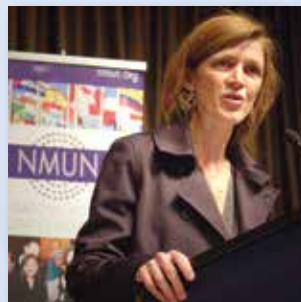
The Hon. Samantha Power US Permanent Representative to the UN

"Don't let anybody tell you that you can't make a difference, because you can – especially if you understand the need to combine your strengths with those of others on behalf of causes that matter."